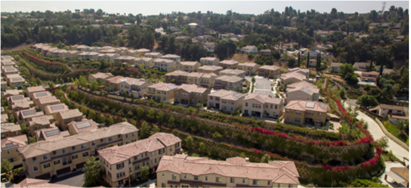
Tiered Walls for Residential Development