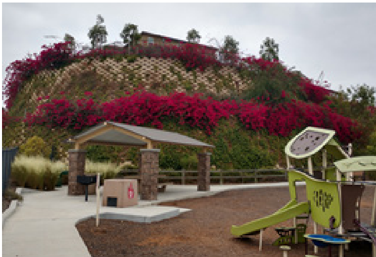
Interior Tiered Walls Supporting Structures