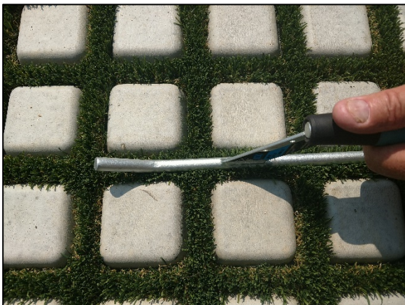
Photo 9: Pressing Drivable Turf ® firmly into position with a pro sled brick jointer