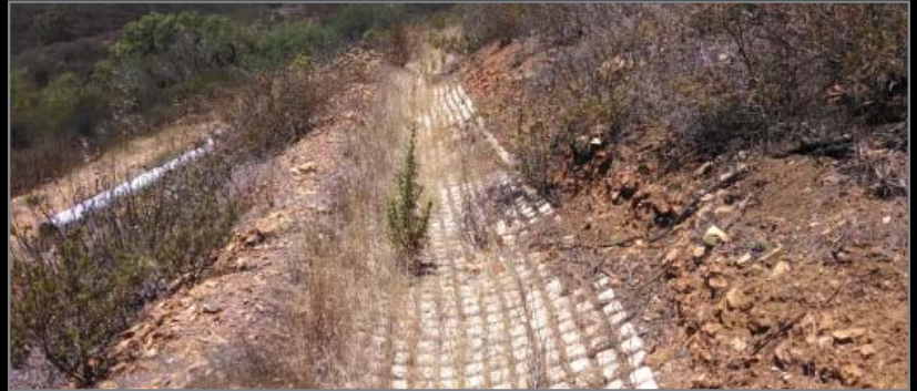
Typical Drainage Swale Detail