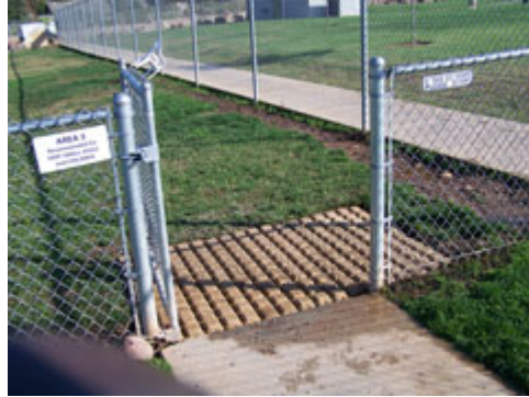
Swimming Pool Pads