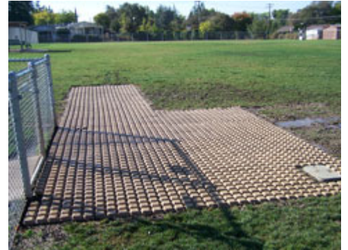
East Gate in Area 1