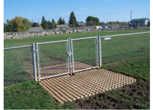
Center Maintenance Gate