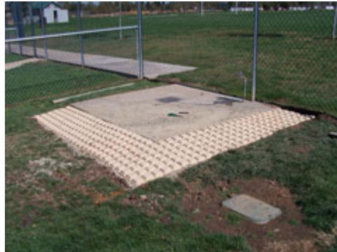
Water Pad Area 1