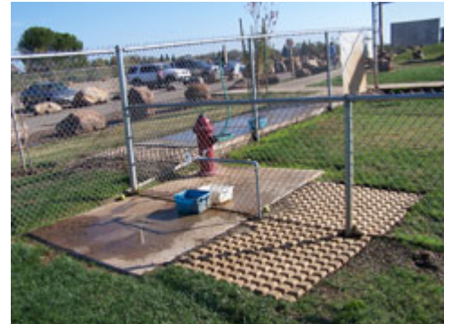
Water Pads in Area 2 and 3