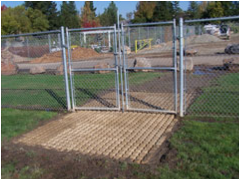
North Maintenance Gate