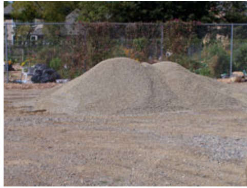
Material – Pea Gravel