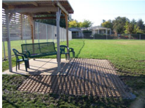
Bench in Area 1 East