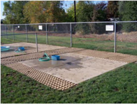
Pool Pads Area 1 and 2