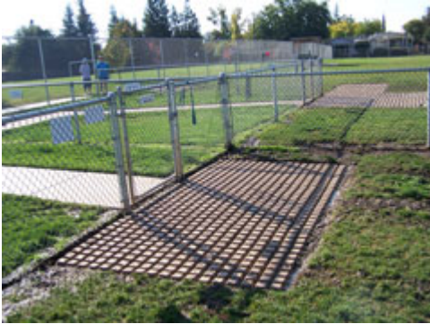
Entry Gate in Area 2