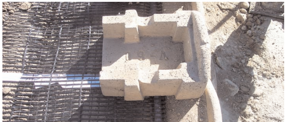
Miragrid® Schedule 80 PVC pipe connection to Verdura 60 block