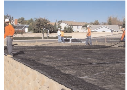
Above: Placing the Miragrid® 24XT & 10XT

In the Verdura Wall construction, heavy earthmoving scrapers were used for wall backfill placement. The wall facing in the lower portion of the wall is the Verdura 60 block.