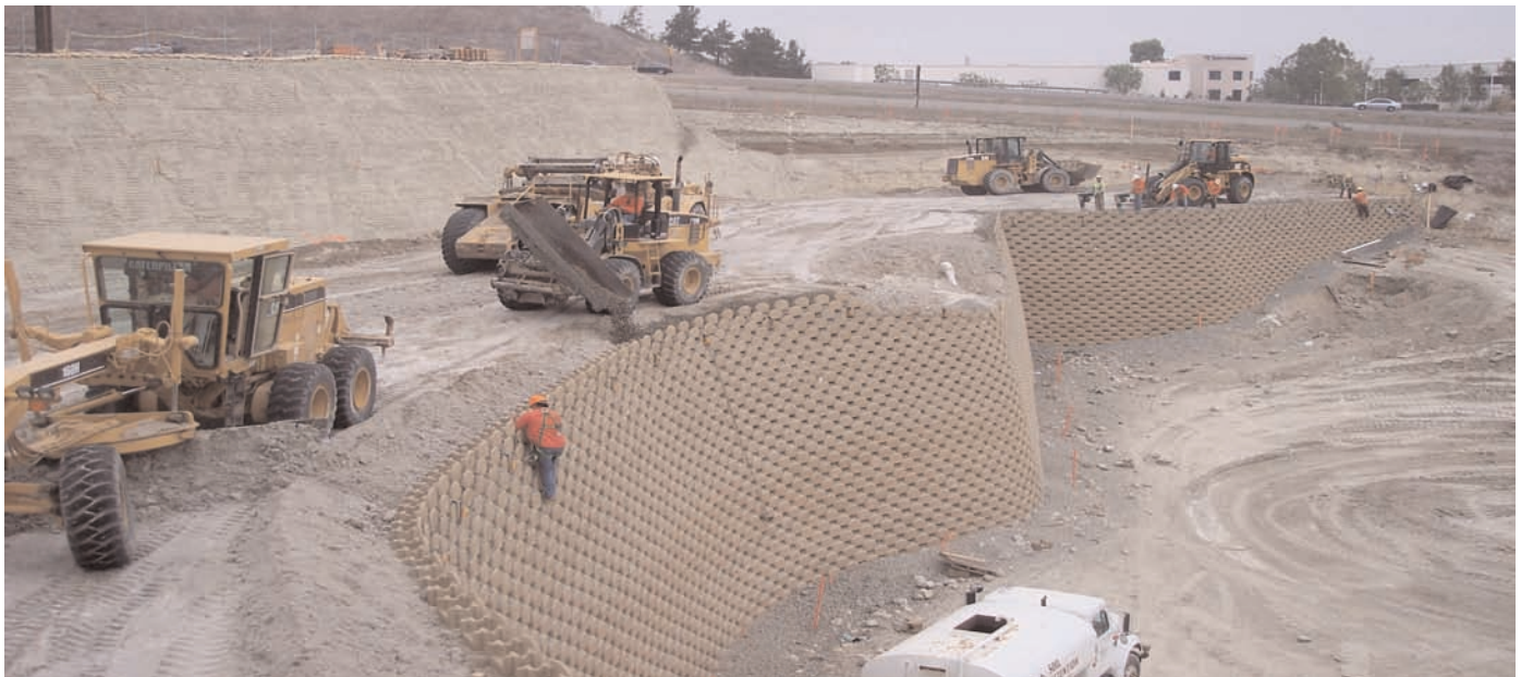
SRS Verdura Wall in construction

TenCate Geosynthetics North America assumes no liability for the accuracy or completeness of this information or for the ultimate use by the purchaser. TenCate Geosynthetics North America disclaims any and all express, implied, or statutory standards, warranties or guarantees, including without limitation any implied warranty as to merchantability or fitness for a particular purpose or arising from a course of dealing or usage of trade as to any equipment, materials, or information furnished herewith. This document should not be construed as engineering advice.